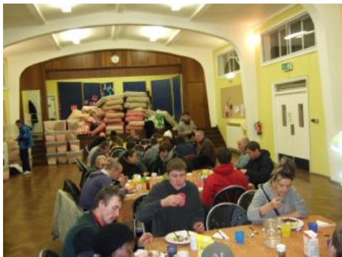
Supper at St Paul's West Hackney church hall in Stoke Newington High St.

Hackney Winter Night Shelter was open from 31st December to 31st March, with St Mary's once again running the shelter each Wednesday evening. Overall, the shelter had its most successful winter ever: there are now 18 churches involved, which enabled us to offer a meal and a bed for the night to 25 people every night – and most nights, the shelter was full. In total, 165 different people stayed at the shelter. With the help of workers from Thames Reach (a London homelessness charity) we were able to help 72 of our guests find more long-term accommodation.