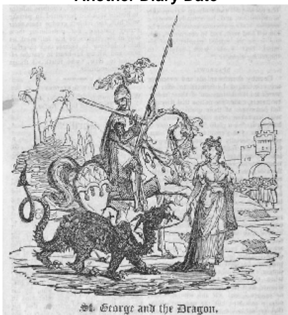
St. George and the Dragon.