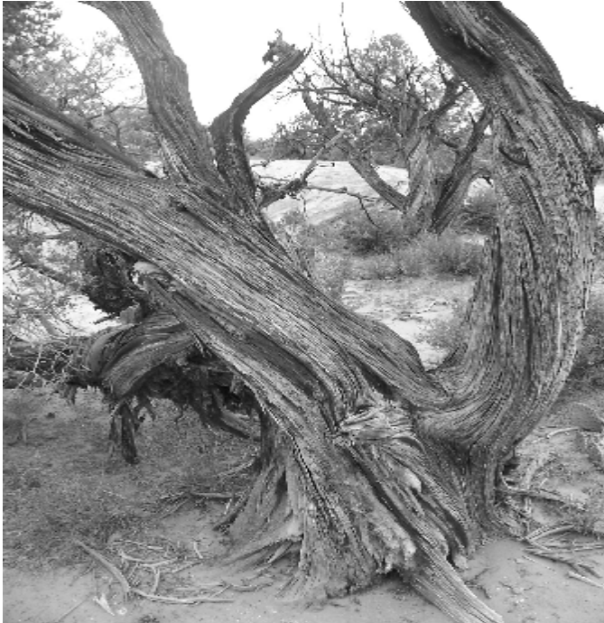
The Uprooted Cross